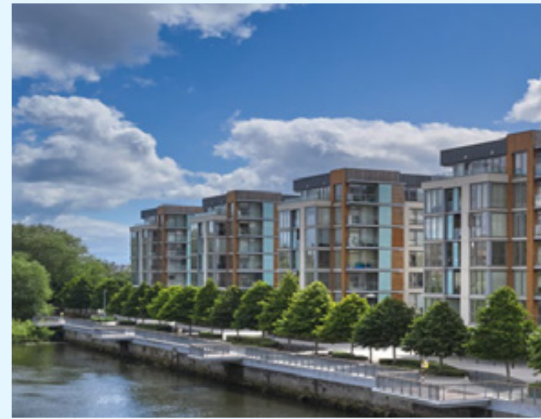
01 CLANCY QUAY DUBLIN 8