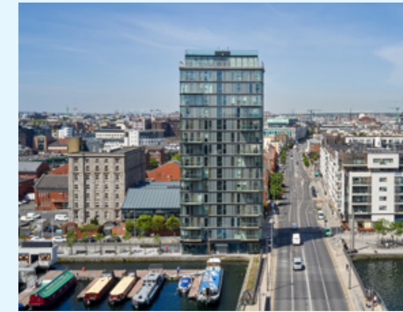
03 ALTO VETRO DUBLIN 2