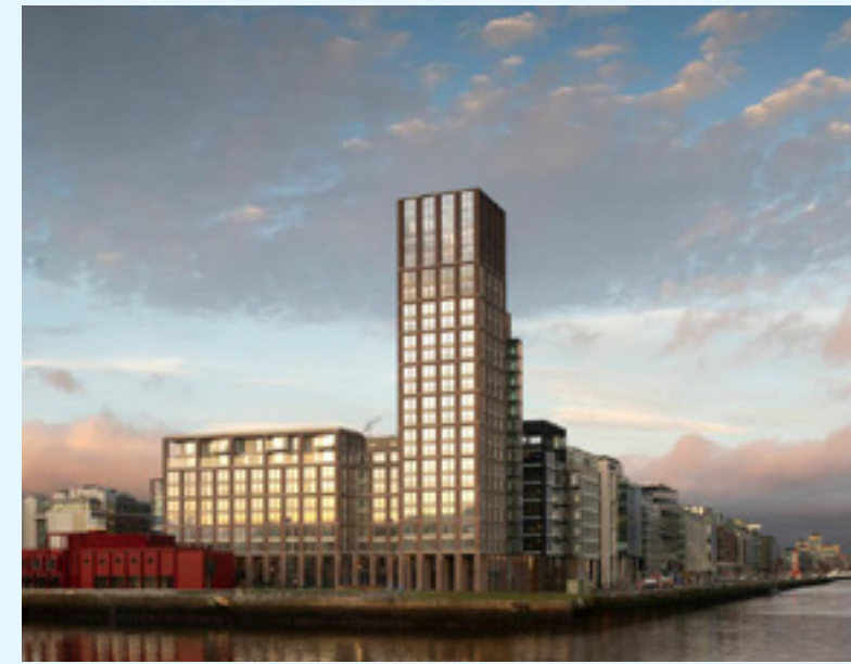
02 CAPITAL DOCK DUBLIN 2