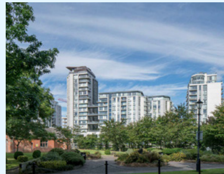
06 VANTAGE SANDYFORD