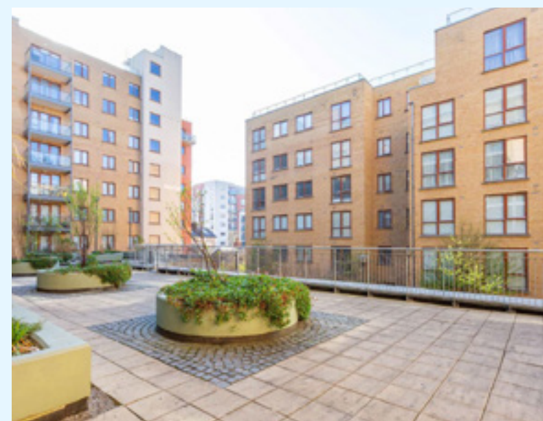
09 NORTH BANK DUBLIN 1