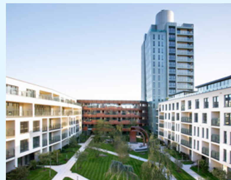
10 THE ELYSIAN CORK CITY