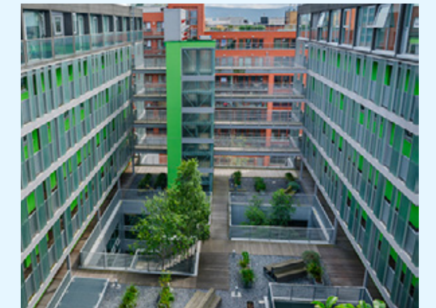
08 LIFFEY TRUST DUBLIN 1