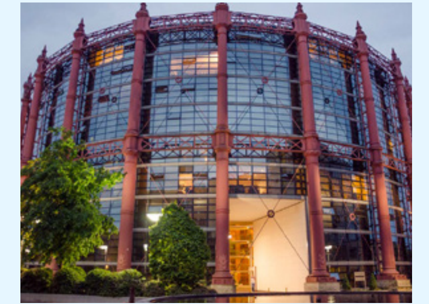
04 THE ALLIANCE DUBLIN 4