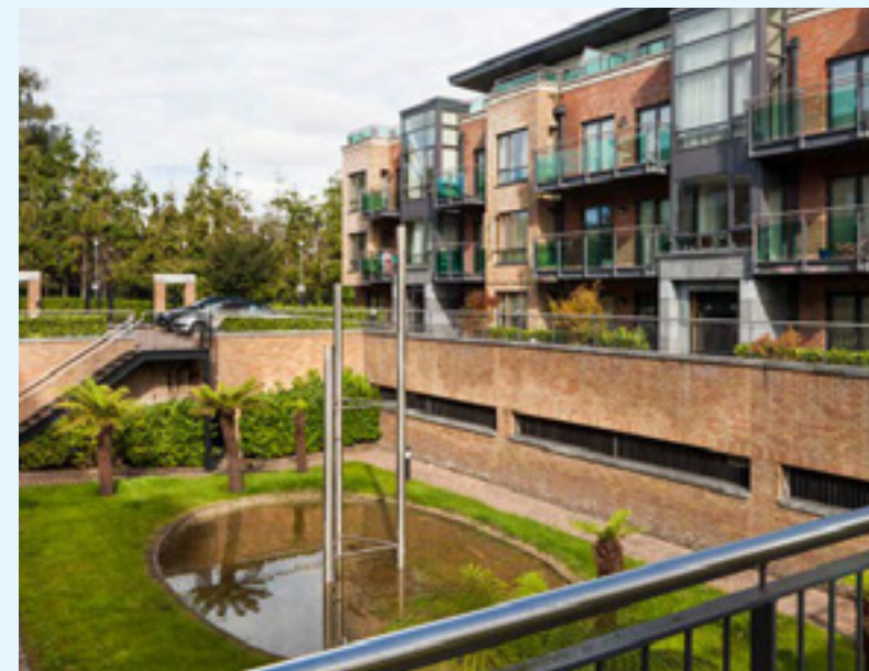
05 SANDFORD LODGE DUBLIN 6