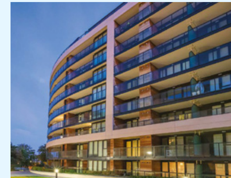
07 THE GRANGE STILLORGAN